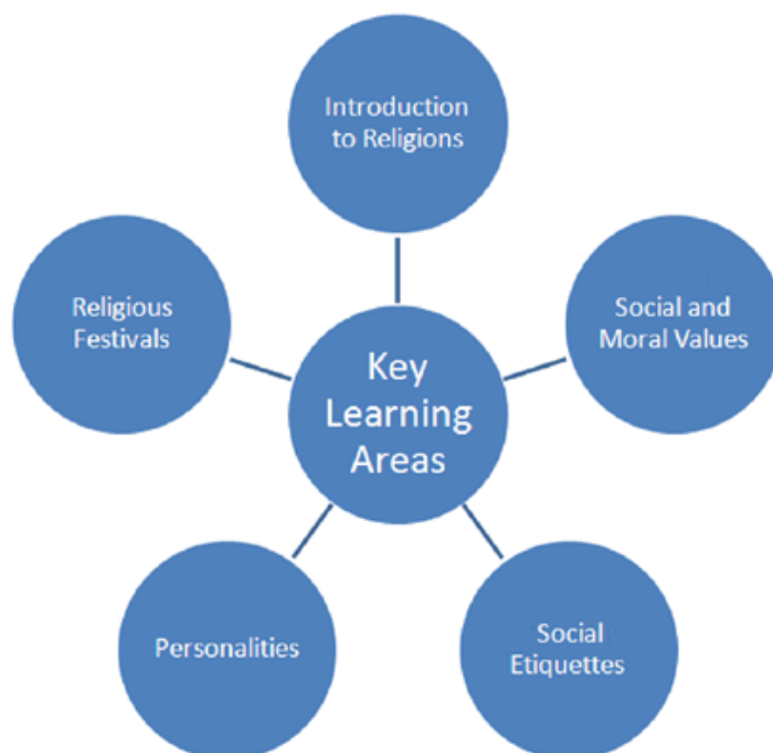
Figure 1: Illustration of Key Learning Areas in grade VI-VIII.